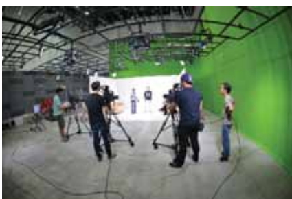
Green Screen Studio