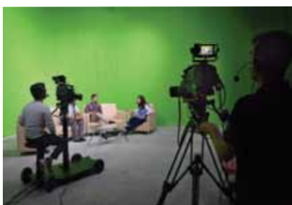
Set and Background Studio