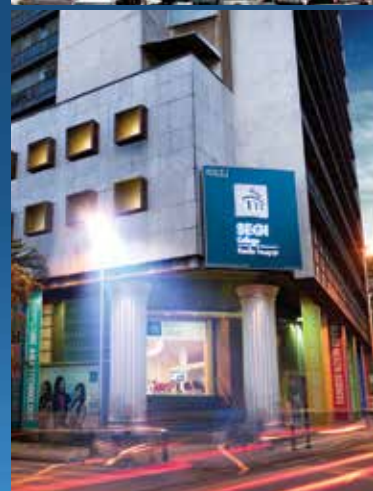
SEGi College Kuala Lumpur