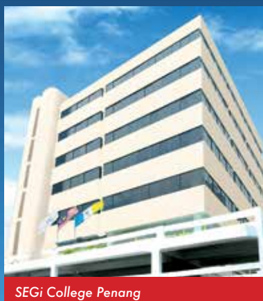
SEGi College Penang