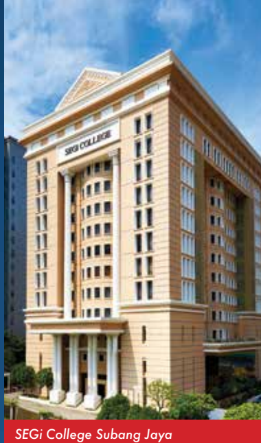
SEGi College Subang Jaya

SEGi is recognized as “The first Malaysian University that earned 5 Stars for prioritizing society’s needs in Malaysia” by QS Stars, an international evaluation system for universities based on auditing.