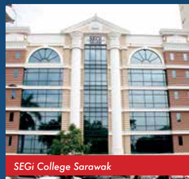
SEGi College Sarawak